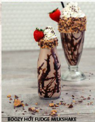
BOOZY HOT FUDGE MILKSHAKE