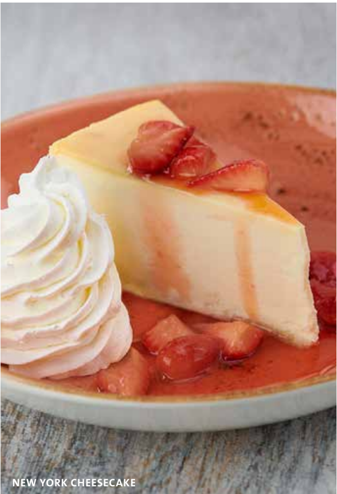
NEW YORK CHEESECAKE