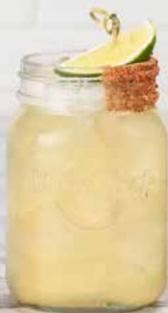
ROCKIN' FRESH RITA