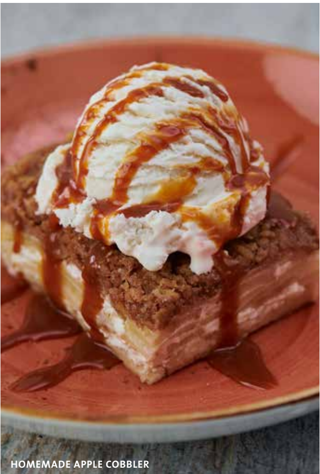
HOMEMADE APPLE COBBLER

Your choice of Madagascar vanilla bean or rich chocolate ice cream blended thick and finished with fresh whipped cream. €7.75