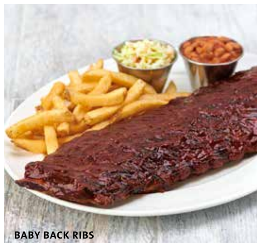
BABY BACK RIBS

Crispy chicken tenders served with seasoned fries, honey mustard and our house-made barbecue sauce. €16.75