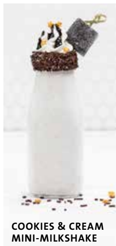
COOKIES & CREAM MINI-MILKSHAKE

All-natural Madagascar vanilla bean ice cream blended with white chocolate and Oreo® cookies, finished with whipped cream and a sugar dusted house-made brownie square. €8.50