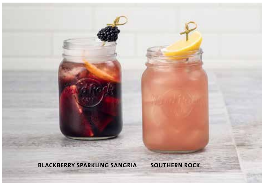
BLACKBERRY SPARKLING SANGRIA

Grey Goose Vodka, Kahlúa, fresh brewed espresso shaken until frothy and chilled. €13.50