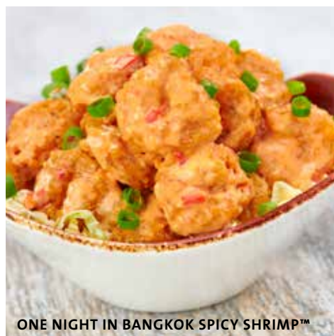
ONE NIGHT IN BANGKOK SPICY SHRIMP™