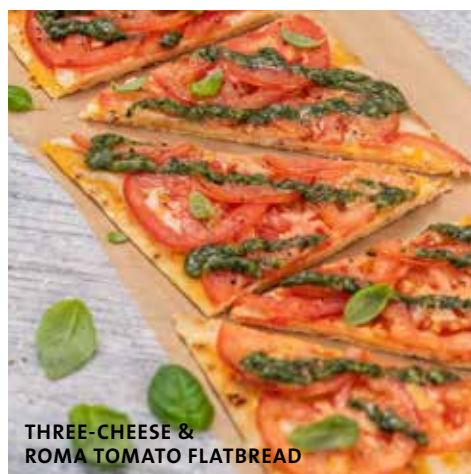
THREE-CHEESE & ROMA TOMATO FLATBREAD