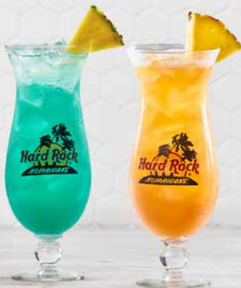
SPARKLING BLUE HAWAIIAN

Absolut Vodka and crisp Rosé, with the refreshing flavours of passion fruit, green tea and lime finished with Fever-Tree Ginger Beer, served in our signature Mule Mug. €12.65