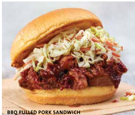
BBQ PULLED PORK SANDWICH

Crispy buttermilk-marinated chicken breast with leaf lettuce, vine-ripened tomato and ranch dressing, served on a toasted fresh brioche bun. €16.75 Spice it up with our classic Buffalo sauce upon request.