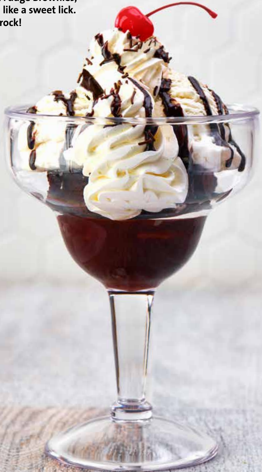
HOT FUDGE BROWNIE

From Milkshakes to Hot Fudge Brownies, nothing says rock n' roll like a sweet lick. Cheers to desserts that rock!