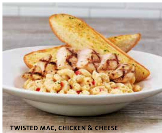
TWISTED MAC, CHICKEN & CHEESE

We hold allergy information for all menu items, please speak to your server for further details. If you suffer from a food allergy, please ensure that your server is aware at the time of order. † Contains nuts or seeds. * These items contain (or may contain) raw or undercooked ingredients. Consuming raw or undercooked hamburgers, meats, poultry, seafood, shellfish or eggs may increase your risk of foodborne illness, especially if you have certain medical conditions. ** If product is not available it may be substituted by a frozen product that is produced at time of manufacture. # (V) Vegetarian, (VG) Vegan. Δ These dishes can be modified for a Vegetarian or Vegan option. (V-A) Vegetarian available, (VG-A) Vegan available. Please talk to your server to arrange any dietary needs.