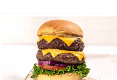
DOUBLE DECKER DOUBLE CHEESEBURGER

Our ice-cream offerings are Irish Strawberry and Cream, Belgian Chocolate or Vanilla.