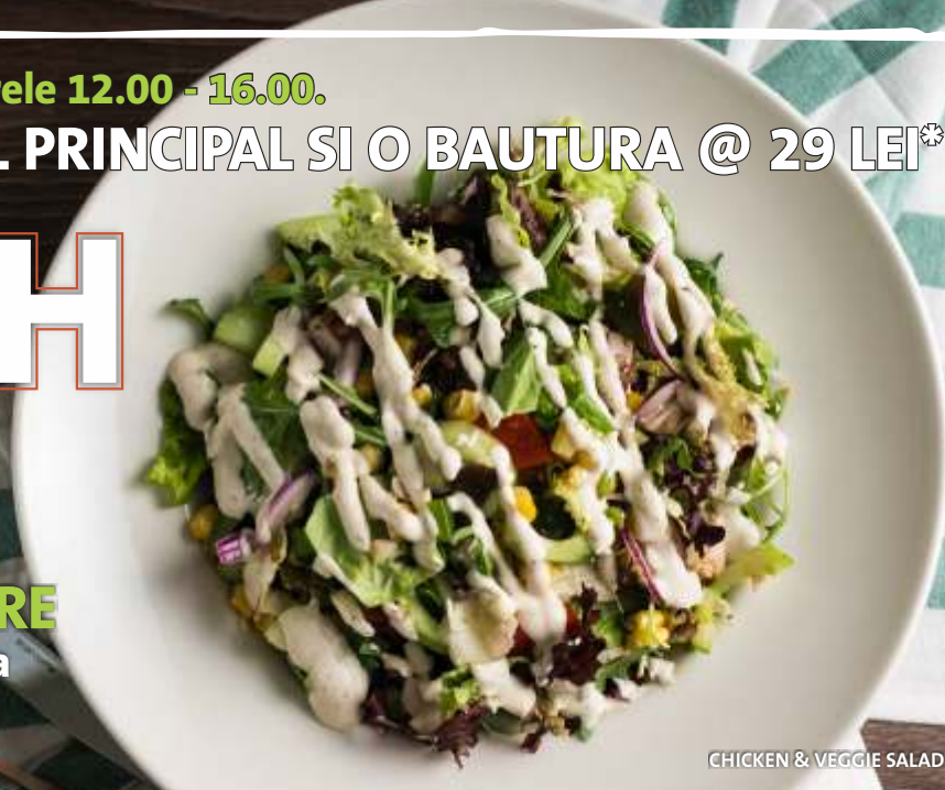
CHICKEN & VEGGIE SALAD

Apa plata / minerala Dorna Coca-Cola, Sprite, Fanta Limonada (290 ml)