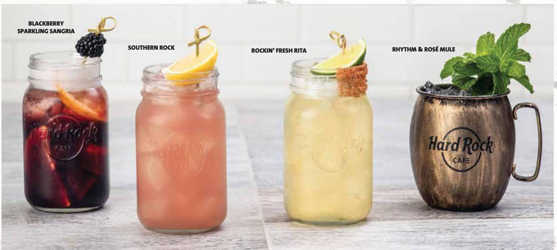
BLACKBERRY SPARKLING SANGRIA