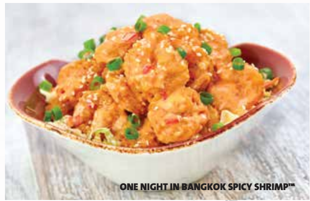
ONE NIGHT IN BANGKOK SPICY SHRIMP™