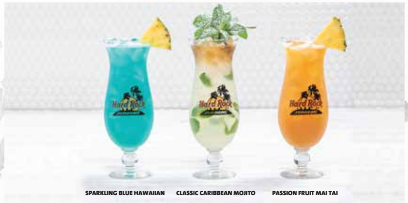
SPARKLING BLUE HAWAIIAN CLASSIC CARIBBEAN MOJITO PASSION FRUIT MAI TAI

Vodka, Gin, Spiced Rum, Cointreau Orange Liqueur, house-made sour mix finished with a splash of Coke. 11 ₪ | with glass 30 ₪