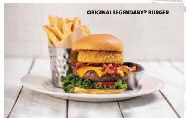
ORIGINAL LEGENDARY® BURGER