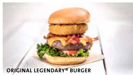
ORIGINAL LEGENDARY® BURGER