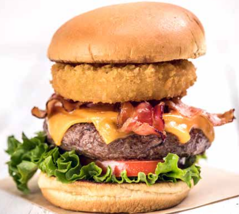
ORIGINAL LEGENDARY® BURGER

WE HOLD ALLERGEN INFORMATION FOR ALL MENU ITEMS. PLEASE VISIT WWW.HARDROCK.COM , SELECT LOCATION AND FOLLOW LINKS TO VIEW OUR ALLERGEN TABLES OR IF YOU HAVE AN ENQUIRY REGARDING ALLERGENS PLEASE CONTACT THE RESTAURANT DIRECTLY.