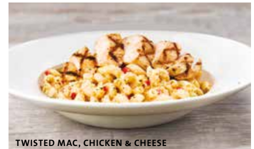
TWISTED MAC, CHICKEN & CHEESE