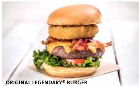
ORIGINAL LEGENDARY® BURGER