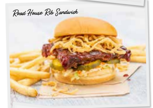
Road House Rib Sandwich