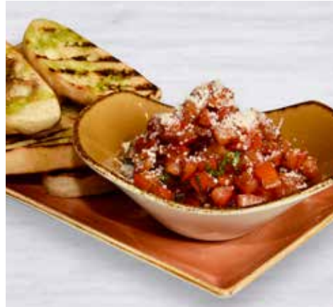
BALSAMIC TOMATO BRUSCHETTA