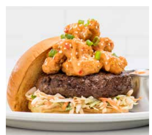
SURF & TURF BURGER