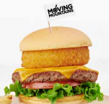
MOVING MOUNTAINS® BURGER