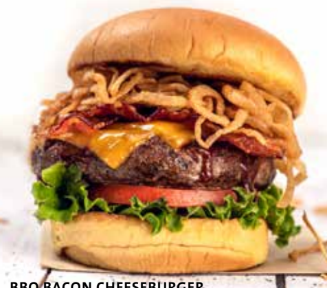
BBO BACON CHEESEBURGER