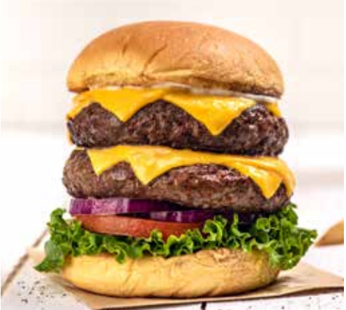
DOUBLE DECKER DOUBLE CHEESEBURGER