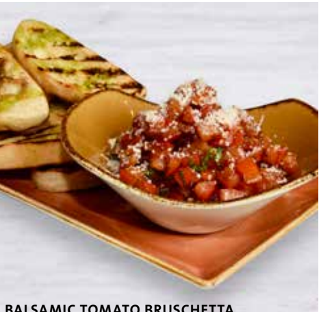
BALSAMIC TOMATO BRUSCHETTA