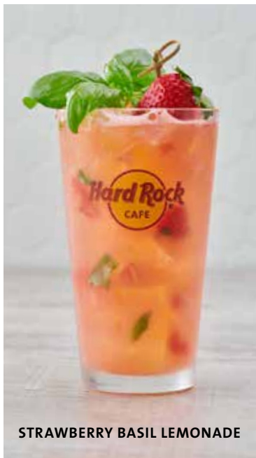
STRAWBERRY BASIL LEMONADE

A tropical blend of mangos, strawberries, pineapple juice, orange juice and house-made sour mix topped with Sprite. £7.20 (205 cal)