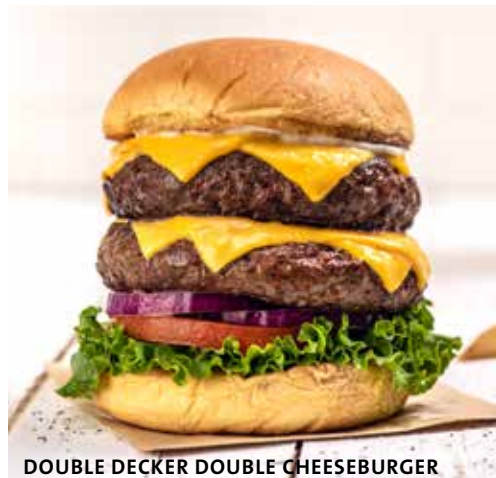
DOUBLE DECKER DOUBLE CHEESEBURGER