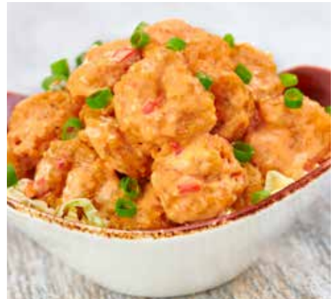
ONE NIGHT IN BANGKOK SPICY SHRIMP™

Roma Tomatoes marinated in balsamic vinegar and fresh basil topped with grated Romano served with a stack of toasted artisan bread and shaved parmesan on the side.* £11.95 (580 cal)