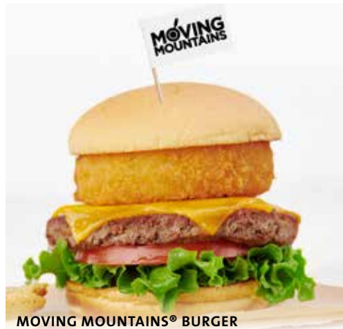
MOVING MOUNTAINS® BURGER