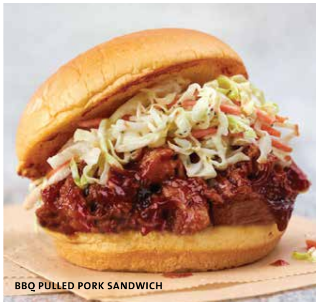
BBQ PULLED PORK SANDWICH

Buttermilk-marinated fried chicken tossed with our classic buffalo sauce with leaf lettuce, vine-ripened tomato and ranch dressing, served on a toasted fresh brioche bun. £16.95 (1260 cal)