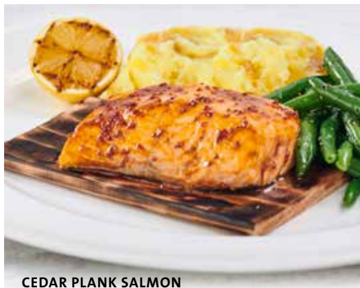
CEDAR PLANK SALMON

Half chicken, brined then basted with our house-made barbecue sauce and roasted until fork-tender. Served with seasoned fries, coleslaw and ranch-style beans.*# £21.95 (1340 cal)