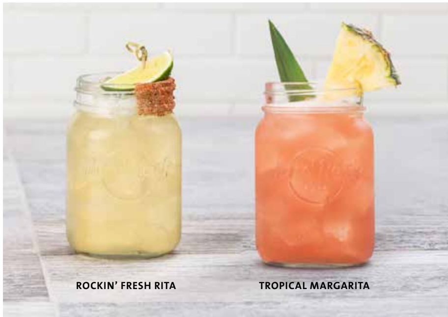
ROCKIN' FRESH RITA

Smirnoff Vodka, Bacardi Superior Rum, Gordon's Gin and blue curaçao with sweet & sour and topped with Red Bull® Yellow Edition. £13.00