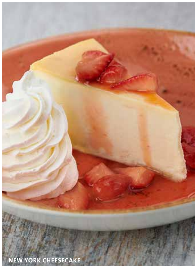
NEW YORK CHEESECAKE

We are often asked about gratuities. Quality service is customarily acknowledged by a gratuity of 10%. A voluntary 10% gratuity is included for your convenience. Thank you.