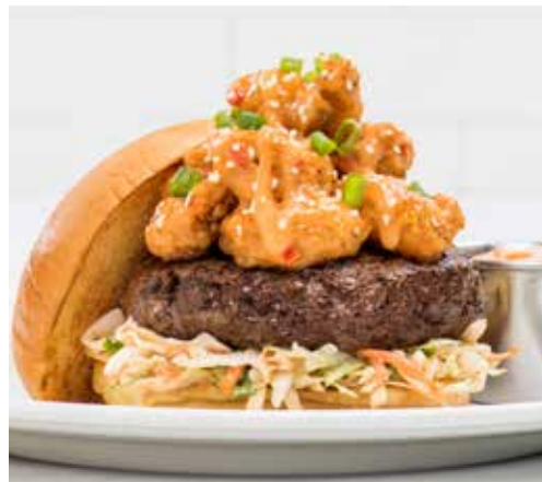
SURF & TURF BURGER

Our signature steak burger topped with One Night in Bangkok Spicy Shrimp™ on a bed of spicy slaw.* £21.95 (1406 cal)