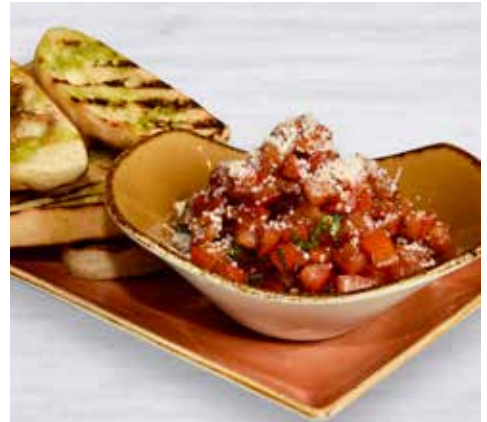
BALSAMIC TOMATO BRUSCHETTA