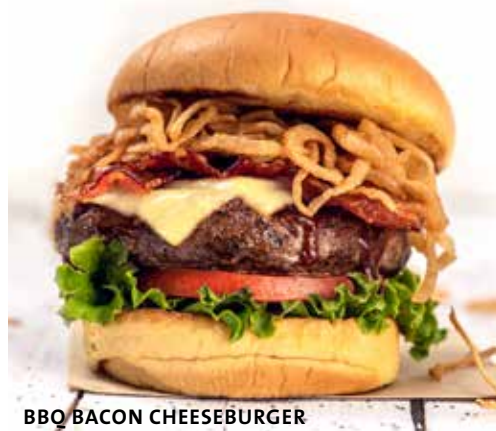
BBQ BACON CHEESEBURGER