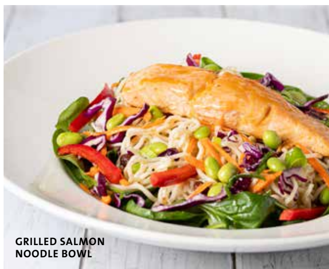
GRILLED SALMON NOODLE BOWL