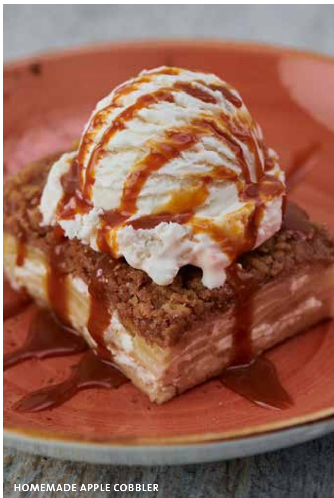
HOMEMADE APPLE COBLER

Your choice of Madagascar vanilla bean or rich chocolate ice cream blended thick and finished with fresh whipped cream. £6.95 (529 cal)