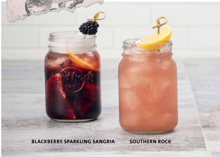
BLACKBERRY SPARKLING SANGRIA