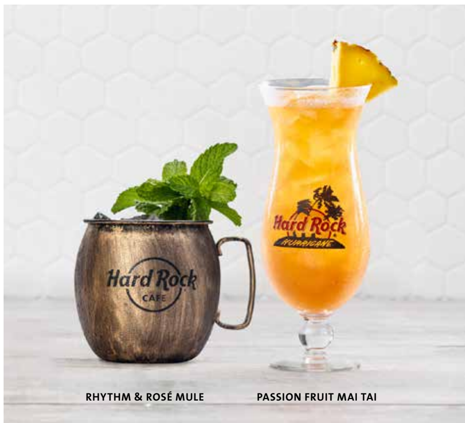
RHYTHM & ROSÉ MULE

Bacardi Superior Rum, Malibu Coconut, crème de banane, grenadine, pineapple and orange juice. £9.25