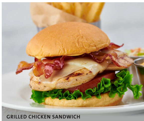
GRILLED CHICKEN SANDWICH

Buttermilk-marinated fried chicken tossed with our classic buffalo sauce with leaf lettuce, vine-ripened tomato and ranch dressing, served on a fresh toasted bun. $18.99 (1320 cal)