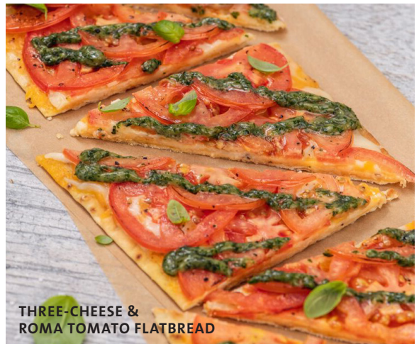
THREE-CHEESE & ROMA TOMATO FLATBREAD

Balsamic-marinated Roma tomatoes and fresh basil topped with Romano cheese. Served with toasted artisan bread drizzled with basil oil and a side of shaved Parmesan cheese. $15.99 (1416 cal)