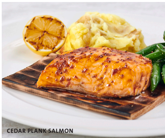
CEDAR PLANK SALMON

Grilled Norwegian salmon, served on a cedar plank with sweet & spicy mustard glaze, served with Yukon Gold mashed potatoes and fresh vegetables.* $28.99 (864 cal)