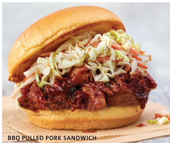
BBQ PULLED PORK SANDWICH