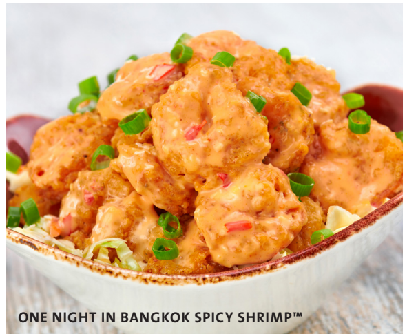
ONE NIGHT IN BANGKOK SPICY SHRIMP™

Add Guacamole $4.50 (123 cal) or Grilled Chicken $6.00 (120 cal) or Grilled Steak* $8.00 (220 cal)