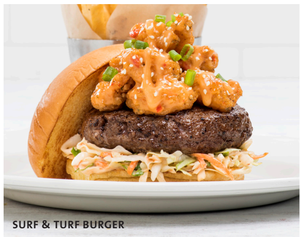
SURF & TURF BURGER