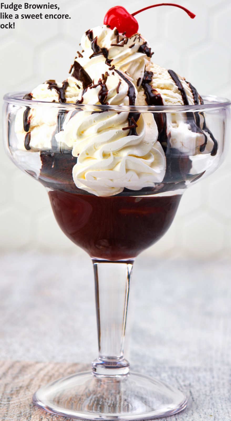
HOT FUDGE BROWNIE

From Milkshakes to Hot Fudge Brownies, nothing says rock n' roll like a sweet encore. Cheers to desserts that rock!