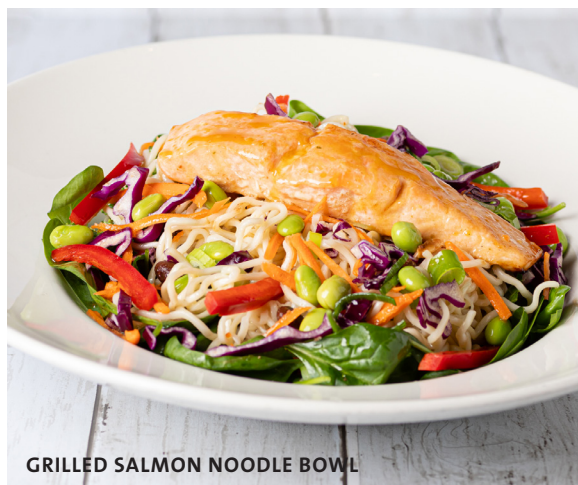
GRILLED SALMON NOODLE BOWL

Substitute Grilled Steak* $26.99 (380 cal)