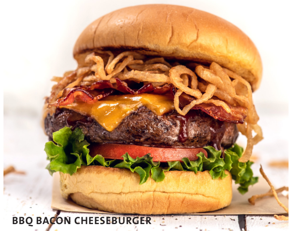
BBQ BACON CHEESEBURGER

Upgrade Cheese Fries with Applewood Bacon $4.50 (960 cal)