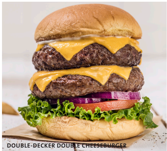
DOUBLE-DECKER DOUBLE CHEESEBURGER