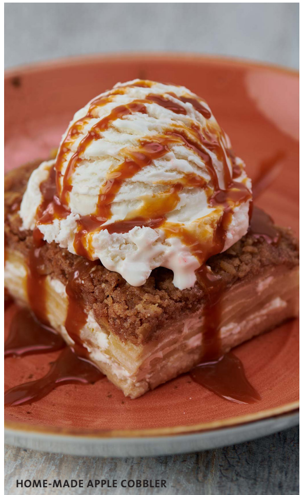
HOME-MADE APPLE COBLER

Your choice of Madagascar vanilla bean or rich chocolate ice cream blended thick and finished with fresh whipped cream. $7.50 (557 cal)